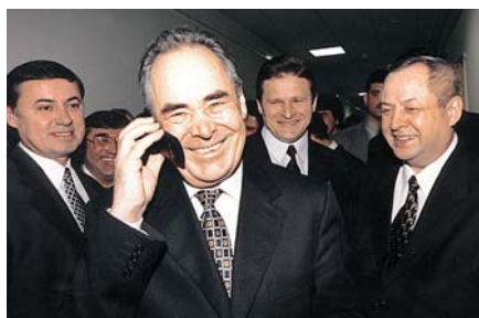
President of the Republic of Tatarstan Mintimer Shaimiev makes the first call in «Santel» cellular network